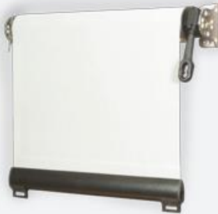
Free Hang Blind Steel Collapsible Hold Downs