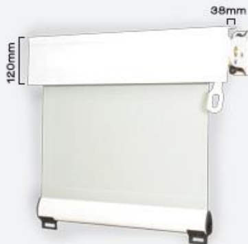
Free Hang Blind - Recess Fascia White Plastic Hold Downs

Free Hang Blinds can be held down at the bottom of the blind. No side support is provided.